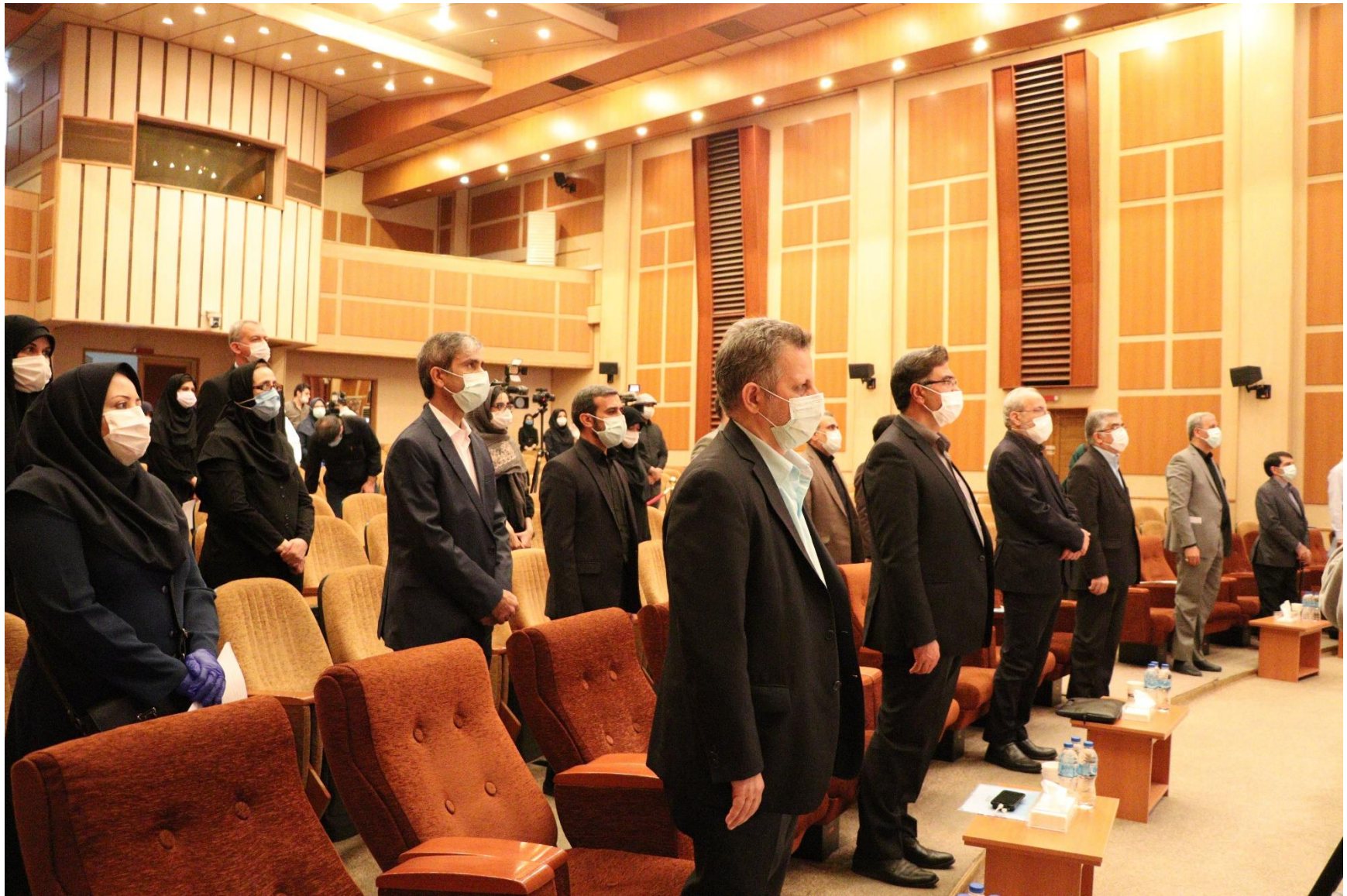
Royan International Virtual Congress (2020) was inaugurated at 9:00 a.m. (Tehran Local Time) on Wednesday 2 September 2020 in Royan Institute Conference Hall. The opening ceremony enjoyed the presence of a limited number of high-ranking officials of ACECR, The Iranian Health Ministry and Royan Institute.